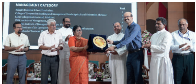
Institutional Ranking Framework 2025. The certificates and cash prizes were presented by R. Bindhu the Hon'ble Minister, Department of Higher Education, Government of Kerala at Rajagiri Valley Campus, Kakkanad on 7 March 2026.