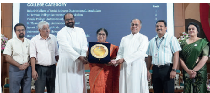
Rajagiri College of Social Sciences secured the First rank in the College category and Rajagiri Business School secured the First rank in the Management category of the Kerala