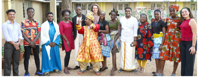
Student Affairs were present for the function. It was followed by various dance and music performances by the students. It was a platform for the students to express themselves and their ethnic culture.