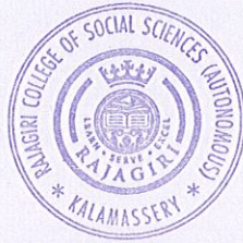
Controller of Examinations