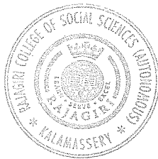
Controller of Examinations