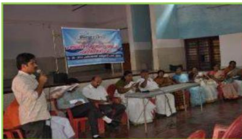
Refer RCSS-Annual Report-2014-15 Page No: 39

Ayurveda Camp and Elders Day Celebration were held at Tholur Santhi Mandiram on 2nd October, 2014. 121 elders participated in the Programme. Various cultural programmes performed by the children and elders added colour to the event.