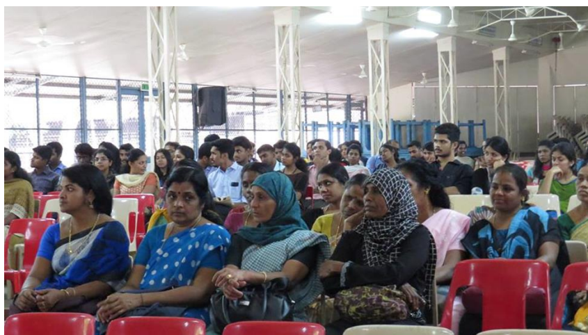
Refer RCSS-AnnualReport-2014-15 Page No: 151