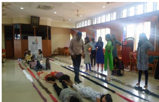
Soft skill training- 9 th and 10 th July 2016